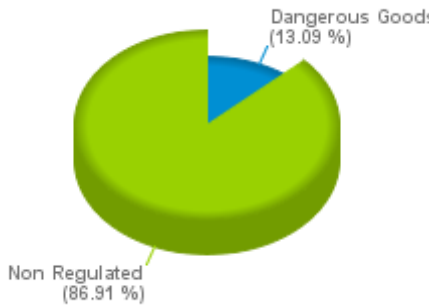
Rail Shipments in Canada 2019